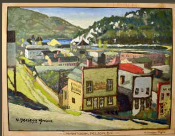
A 2018 donation to the Collection

Touchstones welcomed summer students Tristan Shears, Tressa Ford and Nathaniel Laybourne to work on a number of Archival and Collection projects. Five album projects were added to our ever popular Touchstones