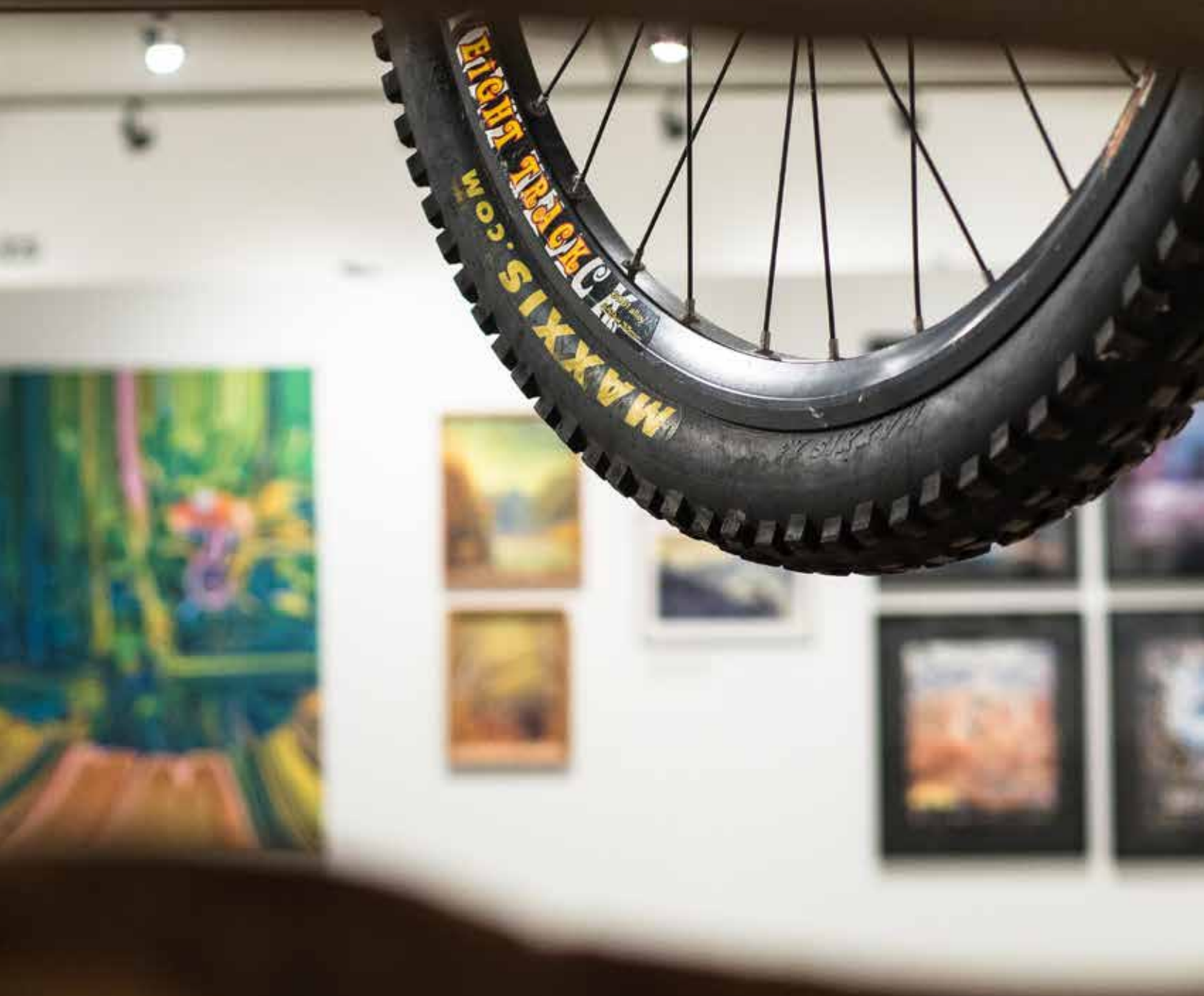
A Mountain Biking Retrospective, installation view, Photo by Louis Bockner

Curated by Astrid Heyerdahl + the Community