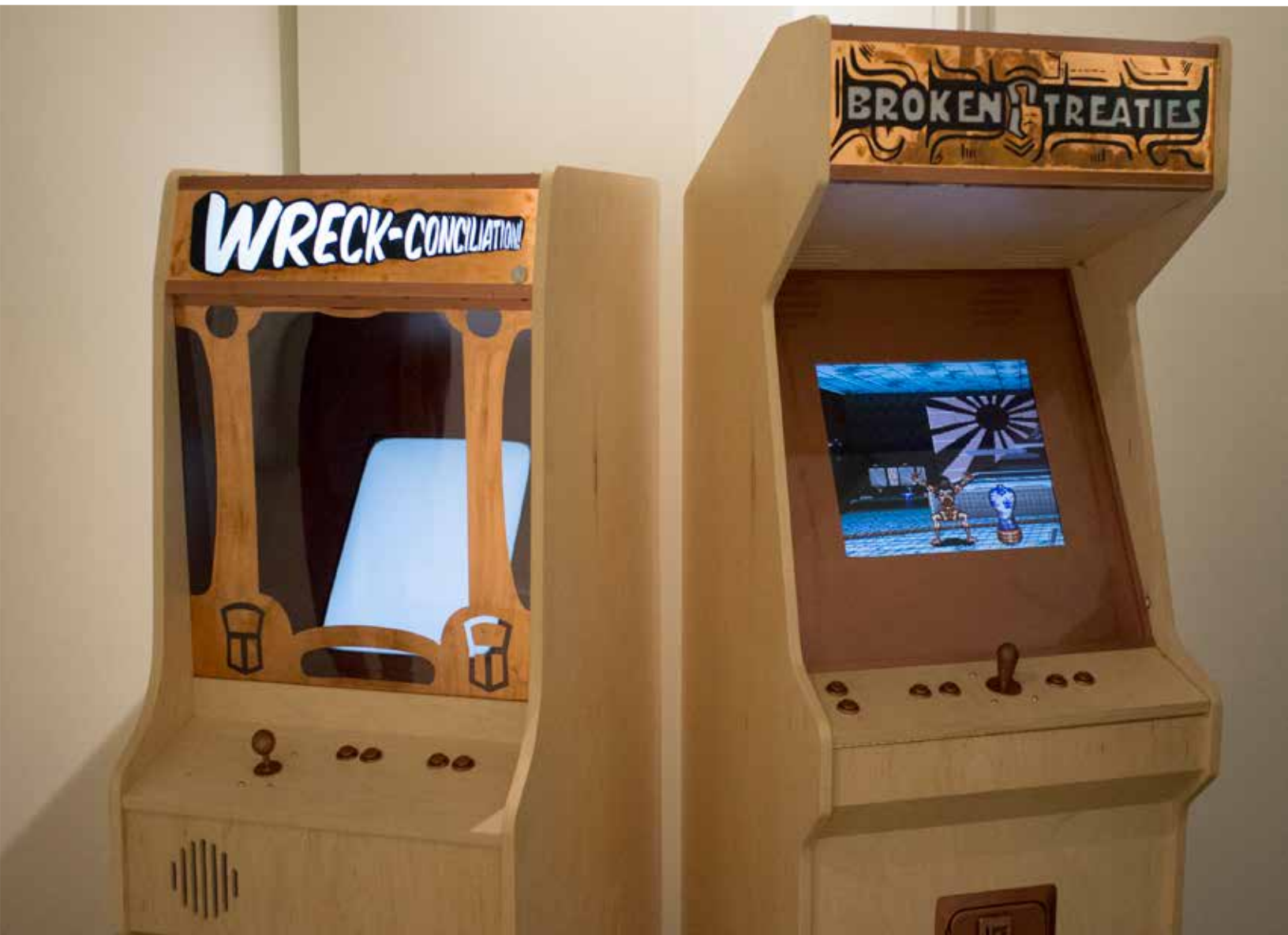
Ready Player Two , installation view

This exhibition was organized and circulated by The Reach Gallery Museum Abbotsford and was made possible through generous support from the Canada Council for the Arts.