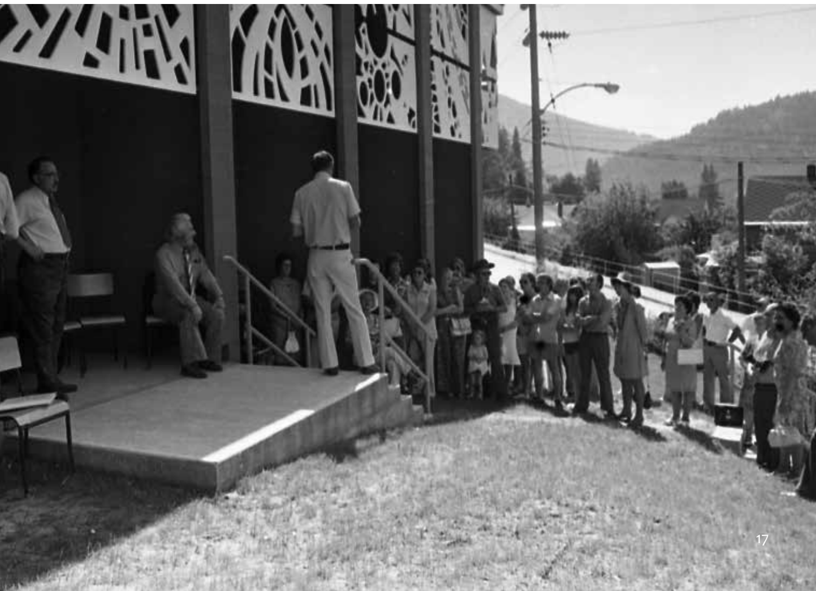
Museum Opening at 402 Anderson Street - June 1974

402 Anderson Street: A History served as a celebratory, commemorative show dedicated to the old museum site on the corner of Anderson Street. This exhibition marked the legacy of those who have contributed to the arts, culture and heritage in Nelson, BC, notably those directly involved in the establishment of the museum society's previous location. 402 Anderson Street elaborates upon storied beginnings such as the building's construction, the Mildred Erb Gallery and the infamous fire of 2003. This exhibition further identified and synthesized the museum society's history, and a continued effort in 'looking forward to the past'.