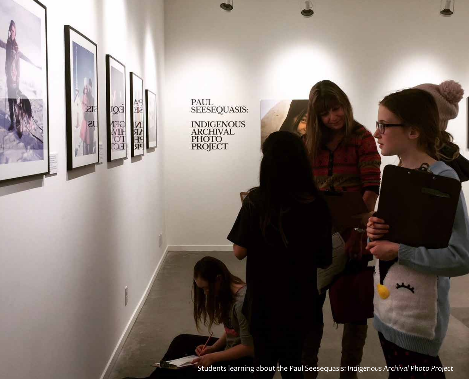
Students learning about the Paul Seesequasis: Indigenous Archival Photo Project