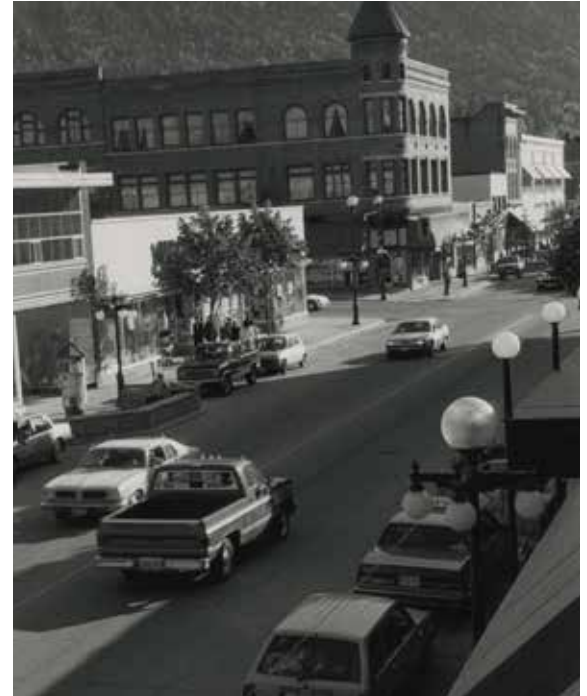
Baker Street 1989

In addition to Flickr, we have been regularly posting six to ten themed and curated archival photographs on Facebook for #ThrowbackThursday. The themes have ranged from photos of residential houses, to sporting events, to industries, to hotels, to summer photos, and more. The most popular posting this year was the Greyhound post in October 2018 that reached nearly 10,000 people.