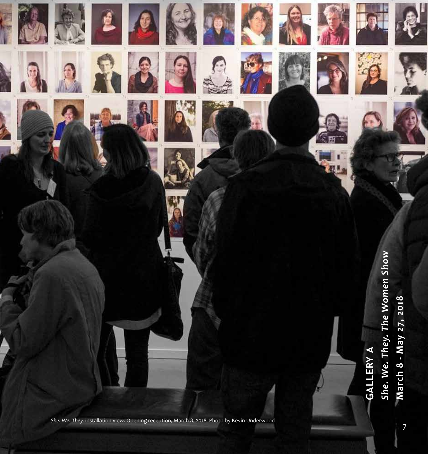
GALLERY A She. We. They. The Women Show March 8 - May 27, 2018

She. We. They. installation view. Opening reception, March 8, 2018