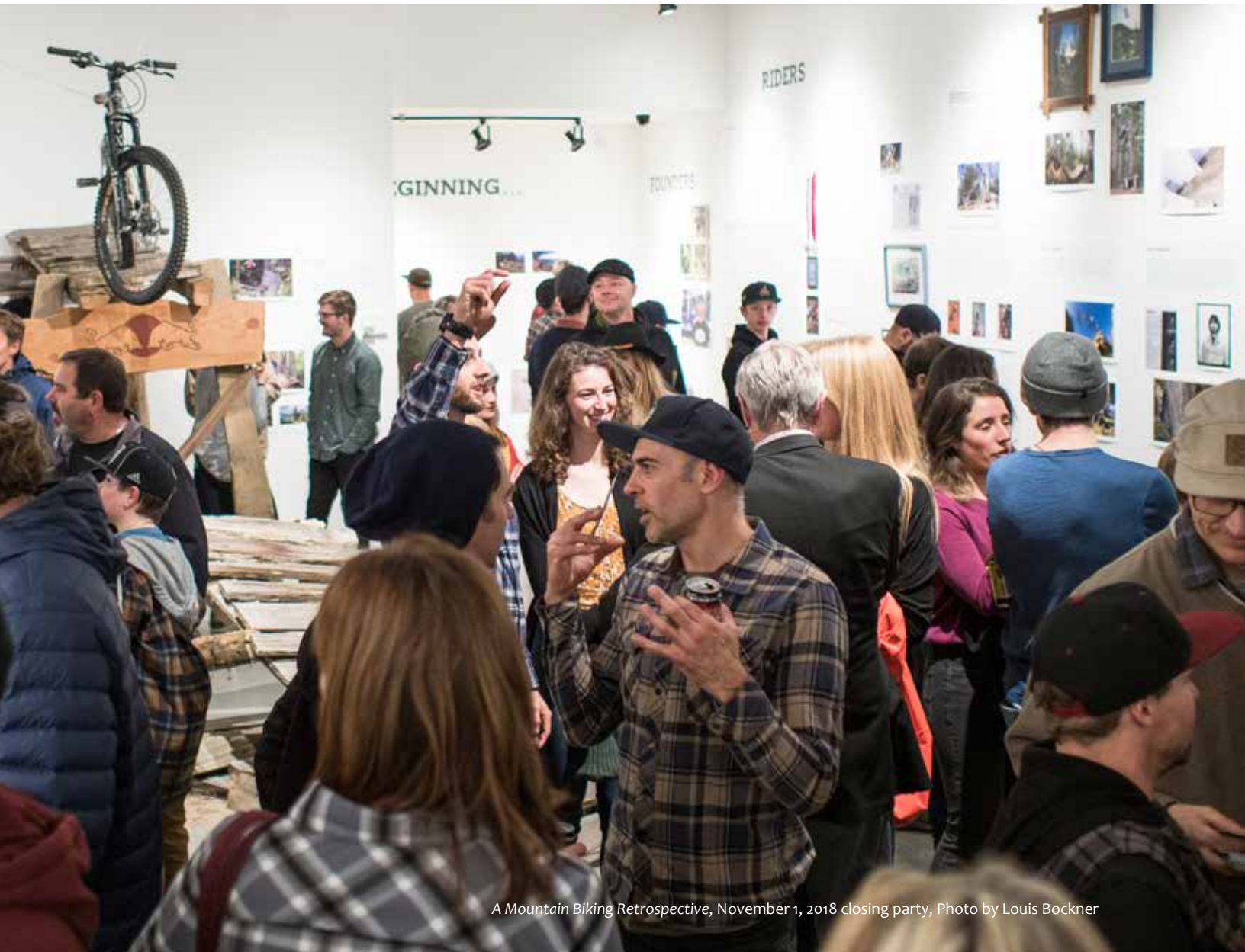
A Mountain Biking Retrospective, November 1, 2018 closing party

A Mountain Biking Retrospective was an exploration of the culture, characters, infrastructure and landscape of mountain bike culture in Nelson and the Kootenays. This exhibit was truly the result of incredible keepers and makers of mountain biking history sharing their stories about the impact of mountain biking in the region. From the mossy overgrown bridges and tracks in the forest to the high tech gear and industry sponsored events, this exhibition illustrated the fascinating and vibrant legacy of mountain bike culture.