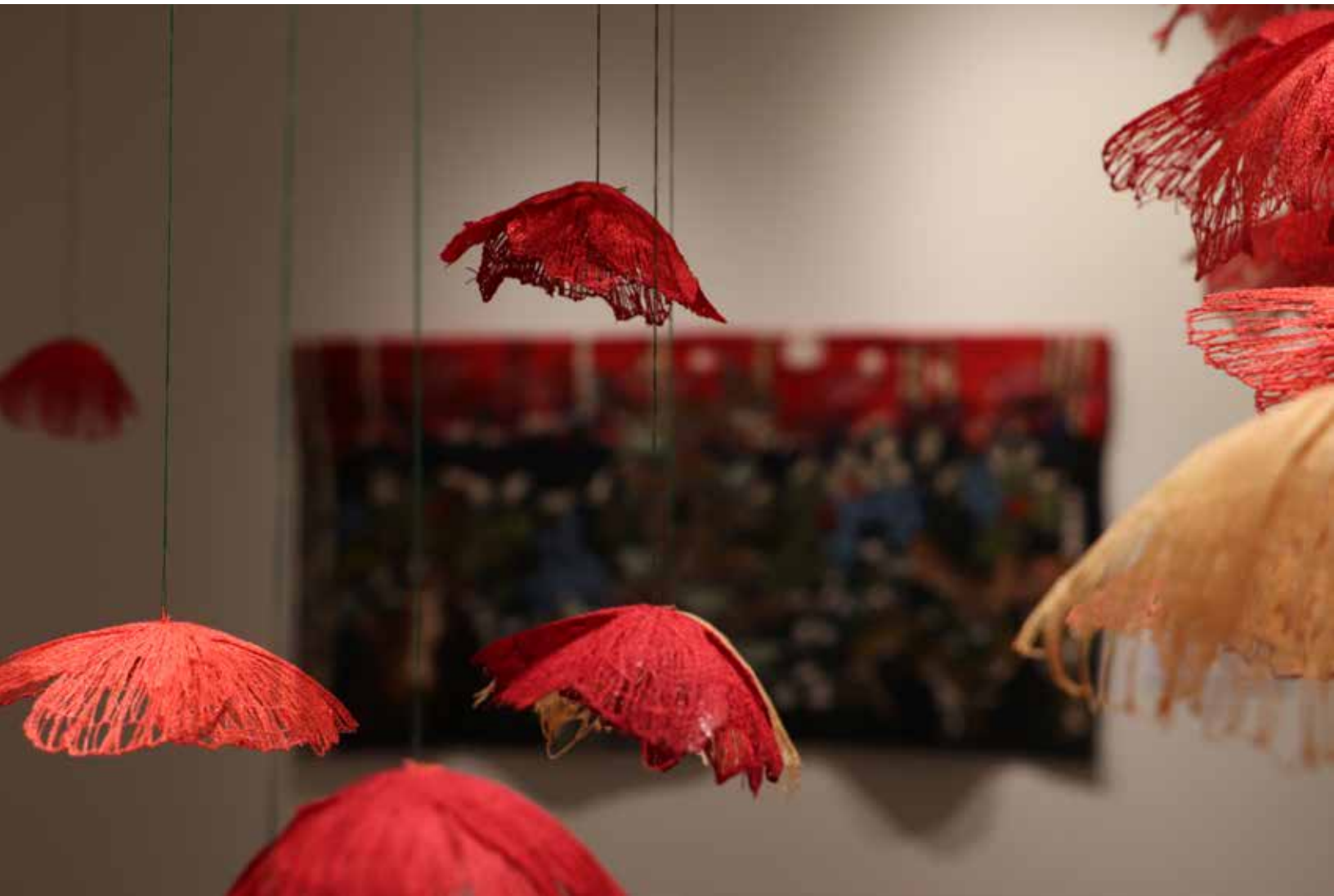
Lost Thread, installation view