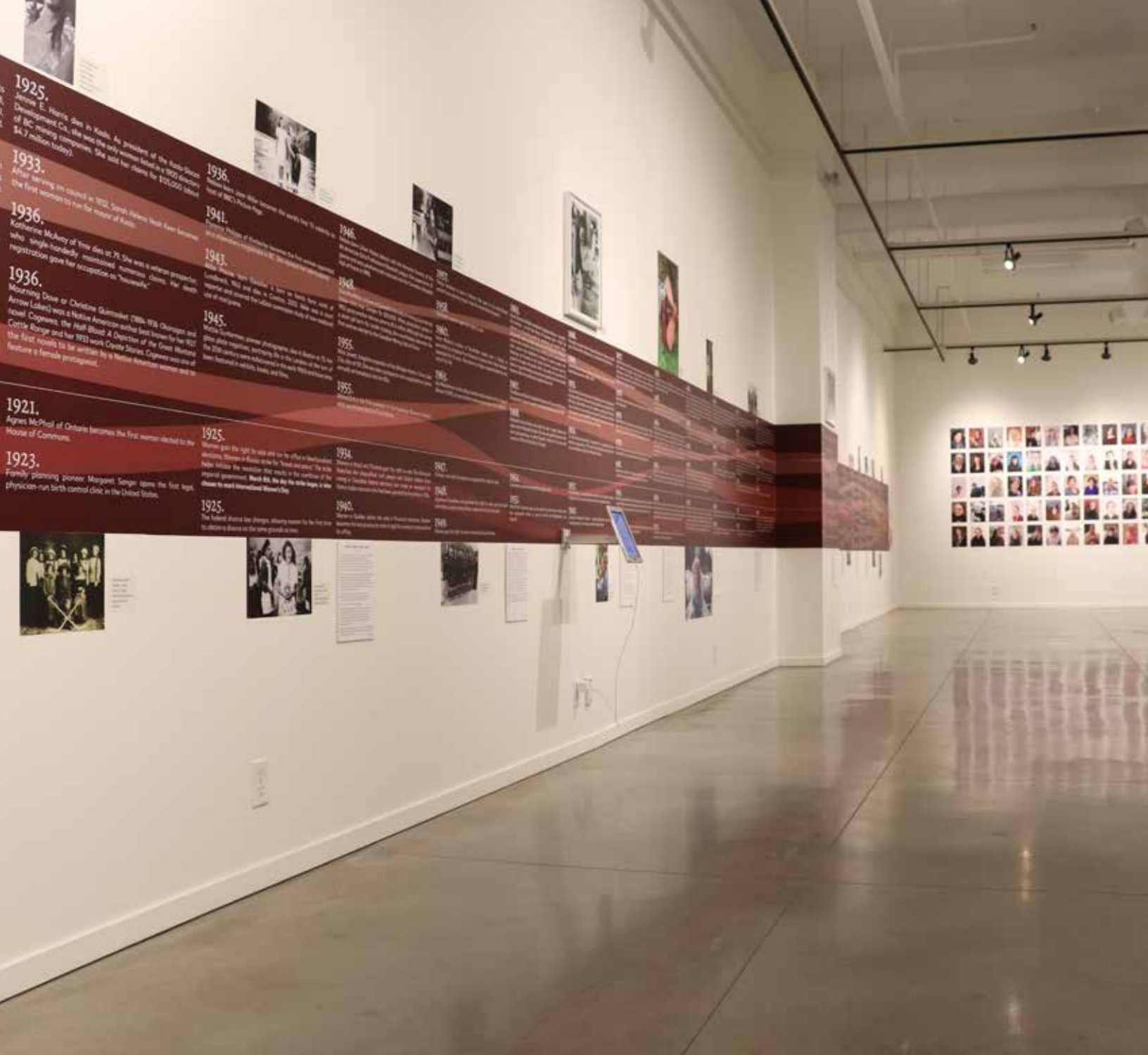
She. We. They: The Women Show, installation view

Touchstones Nelson Museum of Art and History, in partnership with The Nelson and District Women's Centre, developed this well-attended and much loved community-curated exhibition.