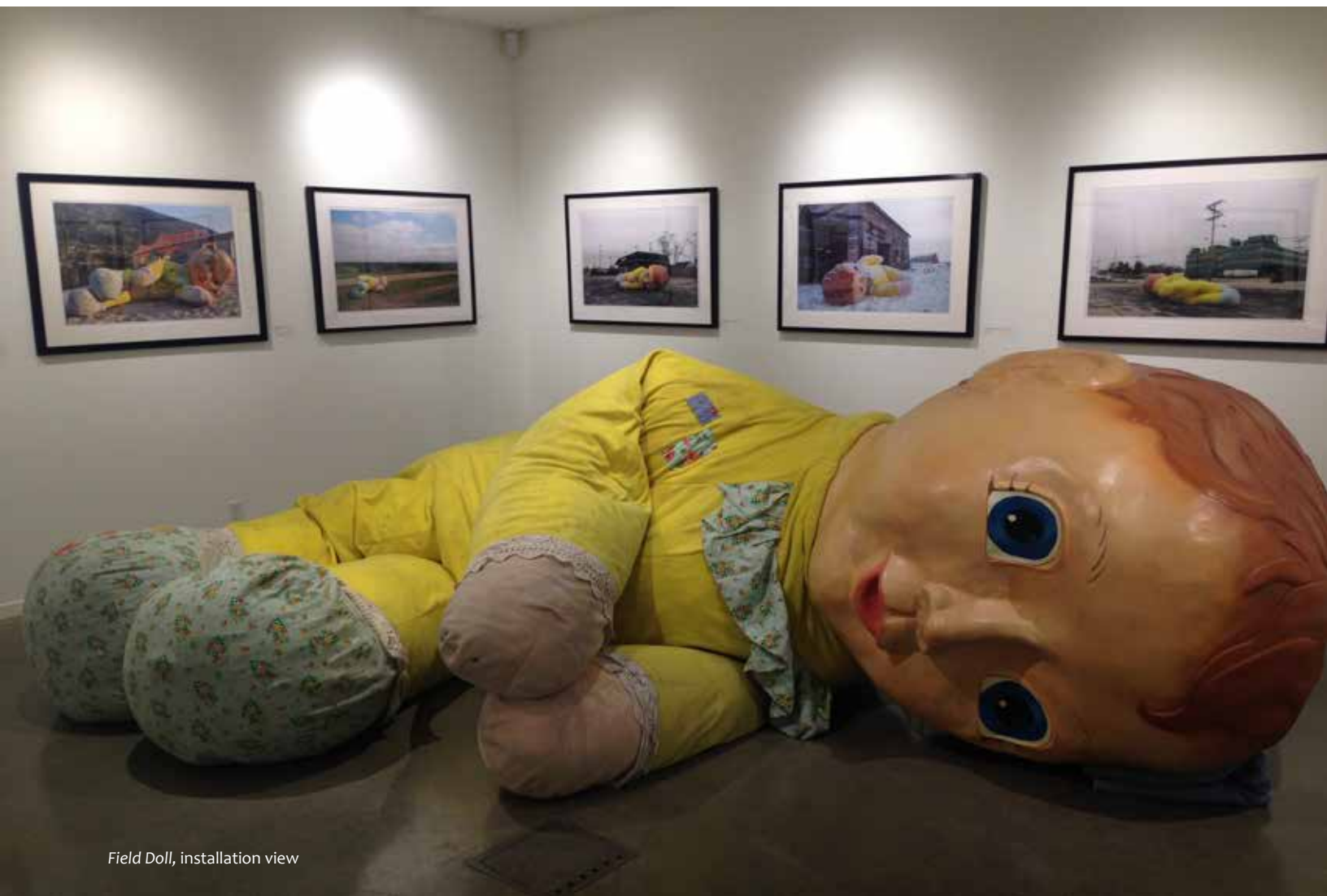
Field Doll, installation view