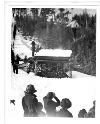
Nelson Ski Club Date Unknown